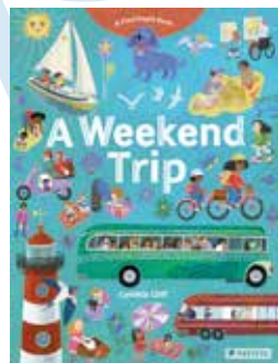
A Weekend Trip RRP: £11.99

Stockists: Available from good booksellers. For stockists visit prestel.com