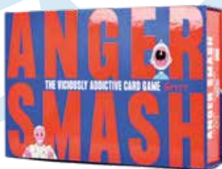
Anger Smash RRP: £14.99

Stockists: Available at farplacegames.com