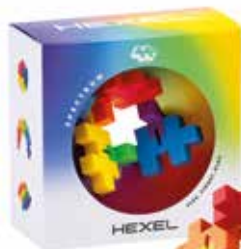
Plus-Plus HEXEL® RRP: £12.99

Stockists: Available from amazon.co.uk and other good toy and gift stores