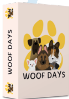
Farplace Games RRP: £5.00 each

Stockists: Available from amazon.co.uk and other good toy and gift stores