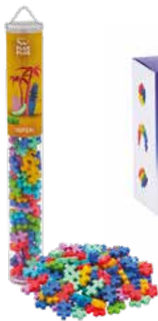
Plus-Plus Tubes RRP: £6.99 (100pc), £11.99 (240pc)

Stockists: Available from amazon.co.uk and other good toy and gift stores