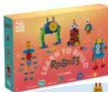
Plus-Plus Learn To Build RRP: £15.99

Stockists: Available from amazon.co.uk and other good toy and gift stores